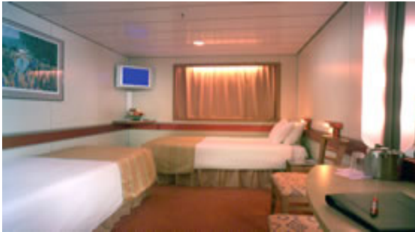
Interior –Category 4A

Price 1 st & 2 nd Person $473 3 rd & 4 th Person $373