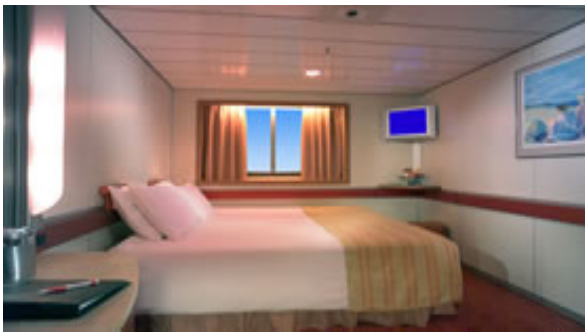
Exterior – Category 6A

Every Carnival guest is assured of spacious, comfortable accommodations. All staterooms have carpeting, ample drawer and closet space, private facilities (shower, basin and toilet), telephone and color television showing first-run films. Our SuperLiners all feature staterooms above ocean level for a more comfortable cruise.